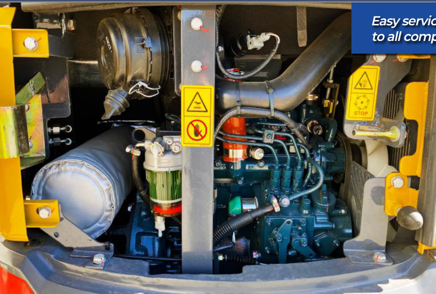
Easy service access to all componentry