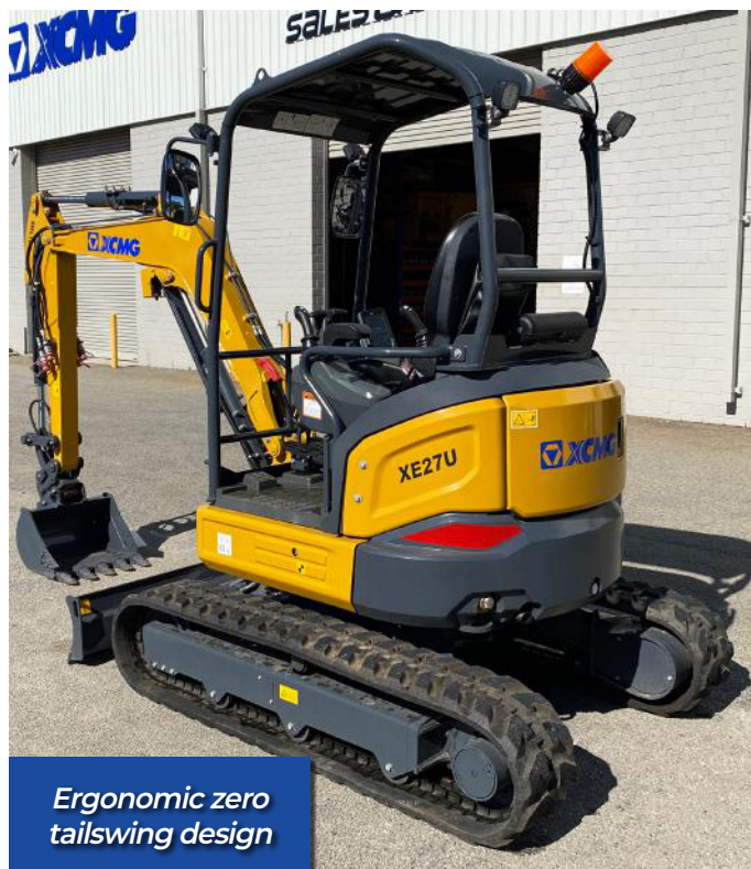
Ergonomic zero tailswing design