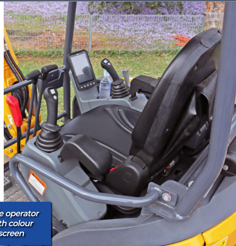
Comfortable operator station with colour display screen