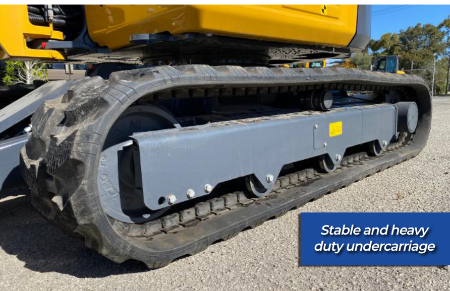
Stable and heavy duty undercarriage